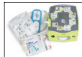
CPR-D•padz come complete with resuscitation essentials including a barrier mask, a razor, scissors, disposable gloves, and a towelette.