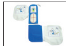
CPR-D•padz offer clear anatomical placement illustrations and a CPR hand positioning landmark.